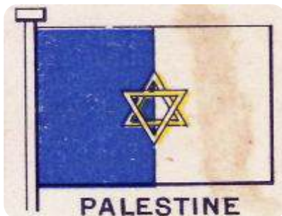
Flag of Palestine in 1939

Now in alphabetical order, get to the flag of Palestine. Yeah, yeah, that's it! What does he look like? Are you surprised? Oh, did you think that Palestine was a sovereign Islamic Arab-Yekrek-Rogue State that was captured by bad Jews?